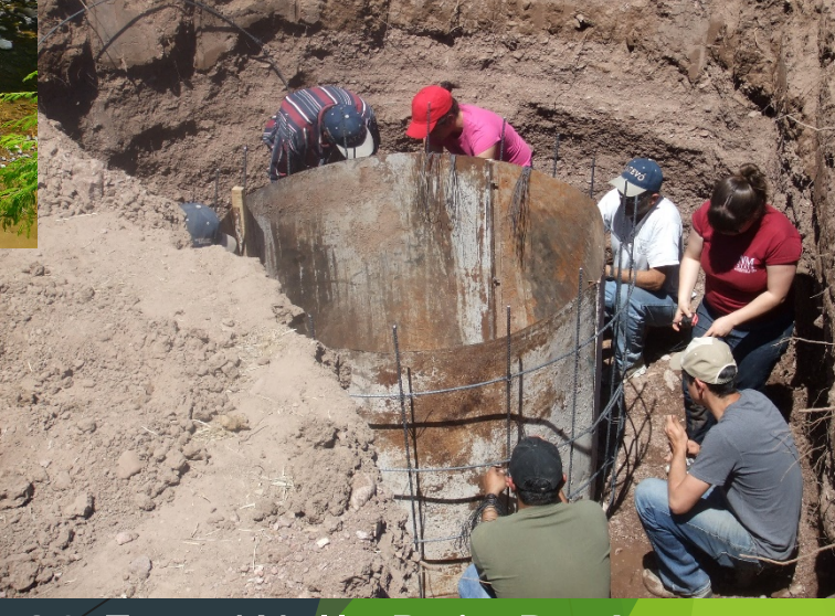
30 Foot Well, Ruiz De Ancones