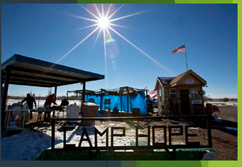
Tent Concrete Pads Camp Hope, Las Cruces