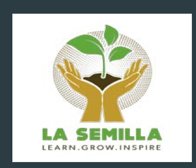
Rainwater Catch System La Semilla, Vado