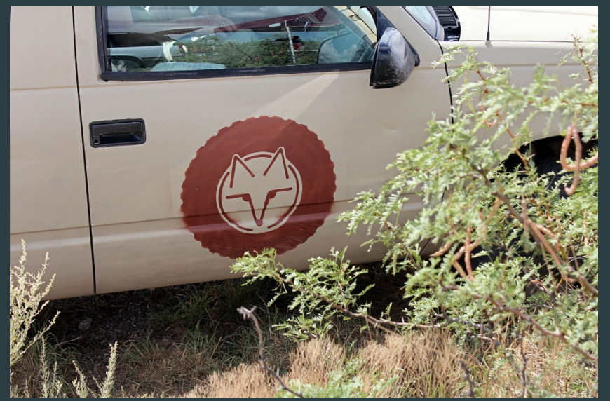
Sustainable Housing Foxhole Homes, Alamogordo