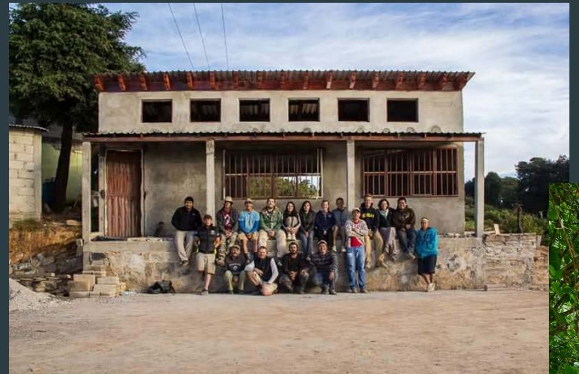
Community Center, Queretaro